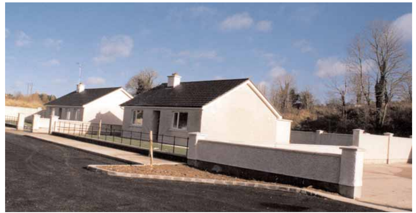
Pottleboy, Cootehill, Co. Cavan

To ensure that proper cost control procedures are observed and to avoid schemes being delayed, all proposals must have received prior approval and an approved budget cost from the Department before proceeding to invite tenders.