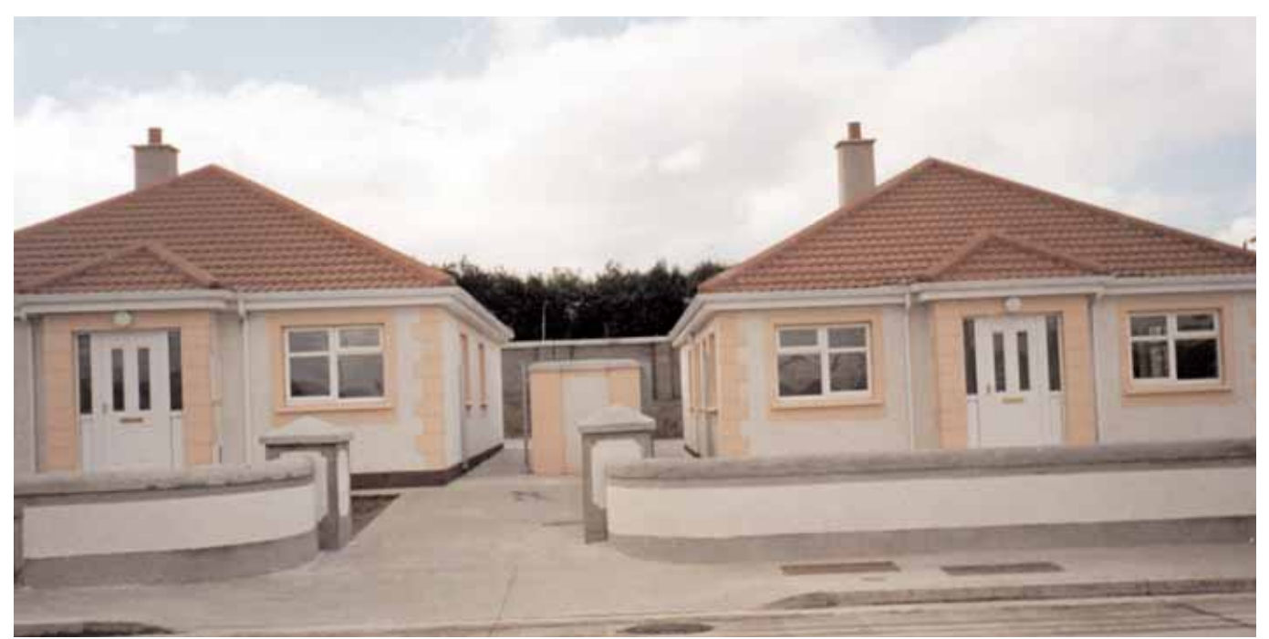
St Francis Park, Rathfarnham, Dublin

However, the guidelines do not purport to provide guidance on compliance with statutory requirements, e.g. the building regulations and as far as possible, do not repeat guidance given in related publications, e.g. The Technical Guidance Documents of the Building Regulations.