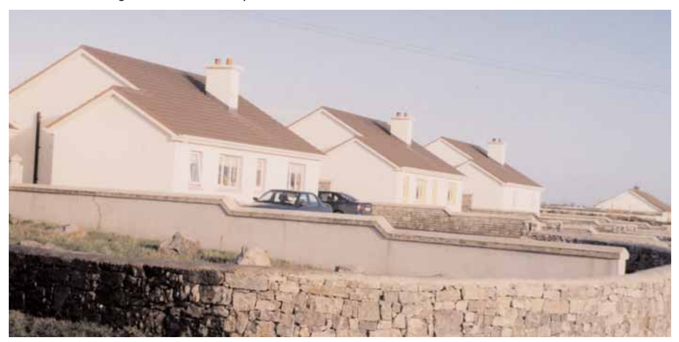
Ballydavid, Athenry, Co. Galway

The provision of a group housing scheme for Travellers must comply with the public notice procedures now follow the procedure of Part 8 of Planning and Development Regulations 2001. (Section 179 of the Planning and Development Act 2000 refers). However local authorities should also consider what further measures might be desirable to inform local residents or their representatives about proposals to provide such schemes within their area.