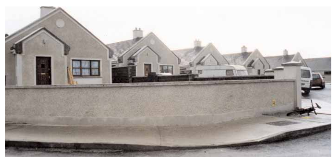
Blacklion, Maynooth, Co. Kildare

The conditions of the scheme, including the funding allowed, are outlined in Department of Environment and Local Government Circular LS 1/97<sup>6</sup>.