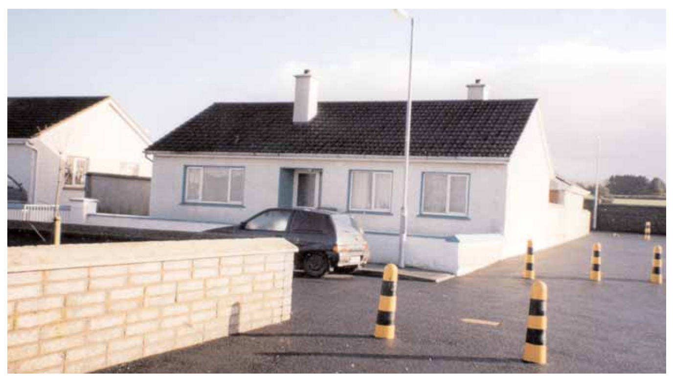
Gort-Bride, Loughrea, Co. Galway

The use of large areas of concrete, cobble-lock or tarmacadam should be avoided in the design of group schemes and provision should be made for a garden area at the rear of the house.