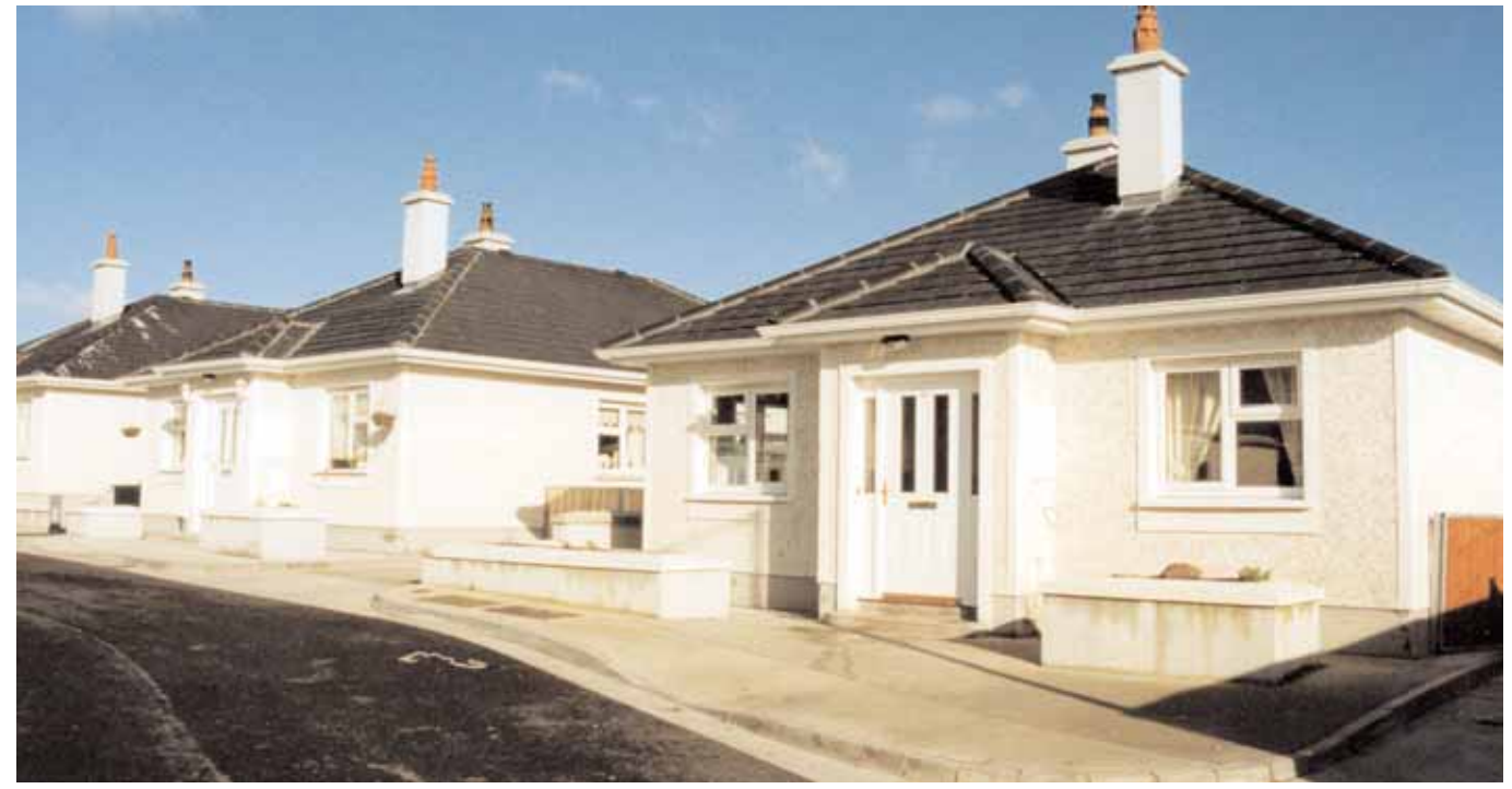
Merlin/Castle Park, Galway